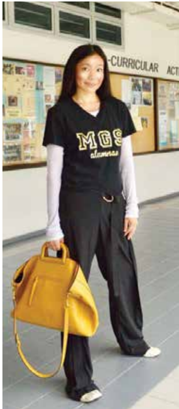
Black Collegiate Tee, $20

Layered over a long-sleeved tee and paired with loose trousers, (instead of jeans) for a comfy, dressy look, this combi is flight-friendly, so you can emerge from a 12-hour red-eye looking effortlessly stylish.