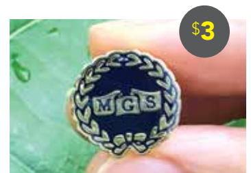
Miniature badge collar pins

We are in the midst of updating our shopping pages on the school website, but you can download the order form from mgs.moe.edu.sg