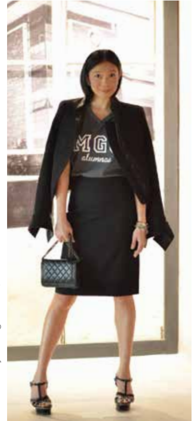
Heather Grey Collegiate Tee, $20

Wear our Alumnae tee to the office? Why not? When worn with a classic black pencil skirt and a matching black blazer, this outfit is a lesson in work style!