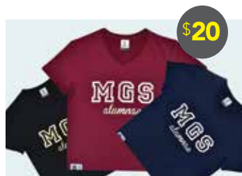
Collegiate T-shirts in 100% organic cotton