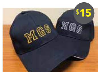
MGS baseball caps, available in silver or gold embossing