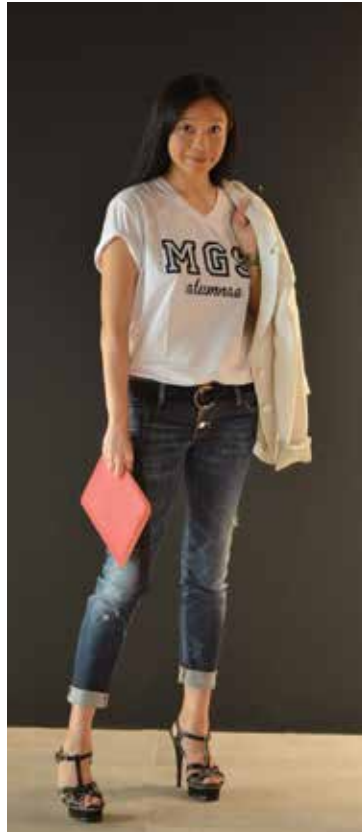
White Collegiate Tee, $20

The classic combi of a white T-shirt and jeans doesn't have to look sloppy. Take it up a notch with accessories: Killer heels, belt and a dramatic clutch for a pop of colour. Pair it with a jacket for an unexpected lift!