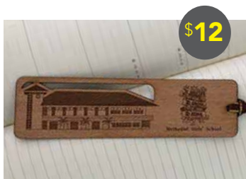
Wooden souvenir bookmark

The MGS Alumnae Association sells a range of MGS Alumnae merchandise is available at our shop and at selected school events. These are the hot favourites and the latest: