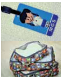
Luggage Tag $5 each