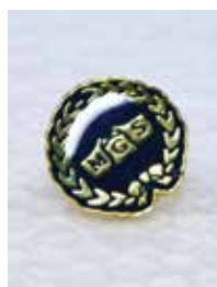
Miniature Badge Collar Pin $3 each