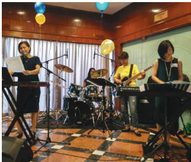
The Drama Mama Band.....which has since been renamed Something Special. They play for special occasions - for a friend's baptism party in December.