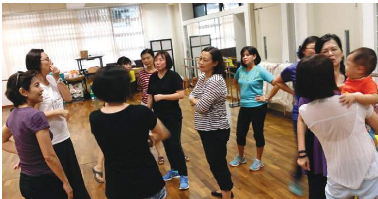
Serious business of sorting out flash mob dance steps

There was no escaping SG50 activities last year so our Class of '81 (born 1965) hatched plans for an MG50 party on 1 August 2015. The theme of this party was M for Music & G for Grooving . The benchmark for a successful reunion party is to have a good turnout and we had close to one hundred people show up! Thank you to Facebook and WhatsApp for facilitating communication. It was a terrific opportunity to catch up with everyone, especially those who had migrated overseas. Our party was also memorable and super fun because of the entertainment in store - ourselves!